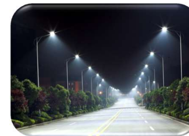
Designed LED Street Light