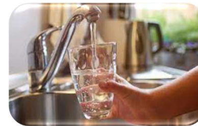
Pure Drinking Water