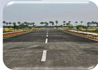
60 & 40 foot Roads