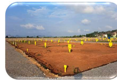
Name & Number Board Display