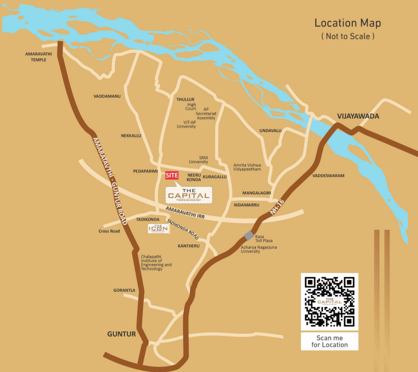
Location Map ( Not to Scale )

Embrace an unparalleled lifestyle at THE CAPITAL, our exquisite collection of premium villa plots in Pedaparimi, Amaravati. Nestled amidst serene environs and boasting of excellent connectivity, our plots offer the perfect canvas for you to build your dream villa. Indulge in spacious living, surrounded by nature's bounty, yet close to all the modern conveniences that Amaravati, the burgeoning capital city of Andhra Pradesh, has to offer.